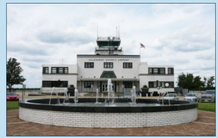
The Allegheny County Airport, unchanged in outward appearance from its 1936 expansion.

In 1926 the area's air hub was the Bettis Field also known as the Pittsburgh McKeesport Airport, which was located on the Bettis Atomic Power Laboratory site in West Mifflin. In June of 1928 a $1.5 million bond was issued to acquire land for an airport. On September 11, 1931 the Allegheny County Airport opened to much The Pittsburgh Postfanfare. Gazette reported, "The huge Pittsburgh-Allegheny county municipal airport, built at a cost of $3.5 million." "was formally dedicated ... in the presence of a throng of close to 100,000 "The persons. greatest ... gathering of nationally known speed and stunt fliers, army and navy planes and commercial craft ... marked the day, with races, stunting exhibitions, parachute jumps, and formation flying filling the day's program."