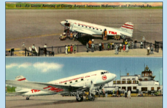
This postcard, circa 1940, shows TWA airships at the gate of the Allegheny County Airport. On its last voyage, TWA Flight 3 taxied into position here; 18 hours later it crashed in Nevada killing Carole Lombard and all other passengers on board.

In 1960 there were 117,345 takeoffs and landings, that number reached a peak of 226,324 in 1970 and in 1990 the number was 201,244. In the latest statistics