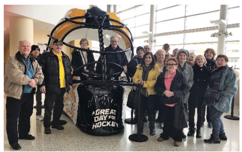
Members at tour

On March 22, 2018 the Allegheny Retirees Association members toured PPG Paints Arena (formerly known as Consol Energy Center). We discovered that PPG Paints facility is much more than seating and an ice rink. It is a museum that pays tribute to the Penguins as well as the history of hockey in Pittsburgh.