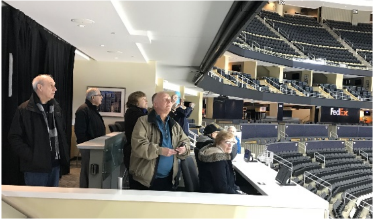
Members at tour

To view more photos from the PPG Arena Tour, go to http://acretirees.org/photos-of-acra-events/