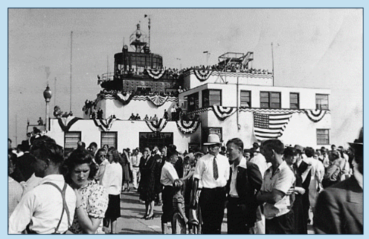
Grand Opening 1931.