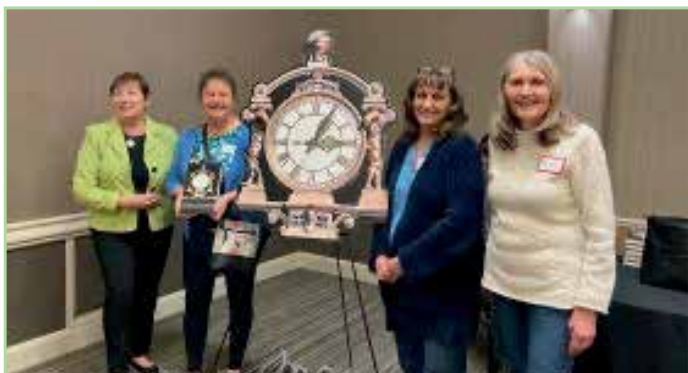
ACRA Members posing with a replica of "the clock."