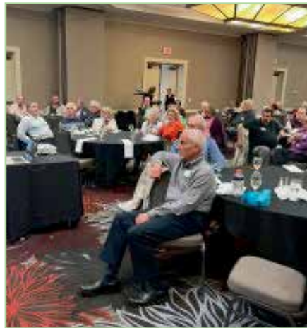
A well-attended event