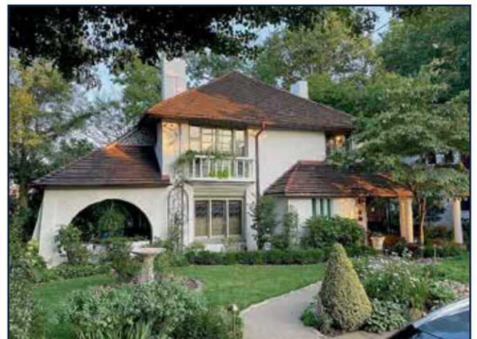
7510 Trevanion Avenue

Information for this article was obtained from the Pittsburgh History and Landmarks website.