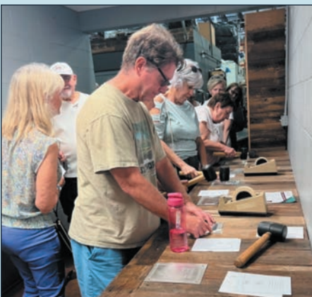
Wendell August Forge July 26, 2023