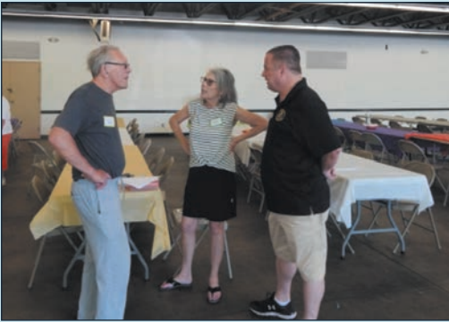
ACRA Summer Picnic June 21, 2023